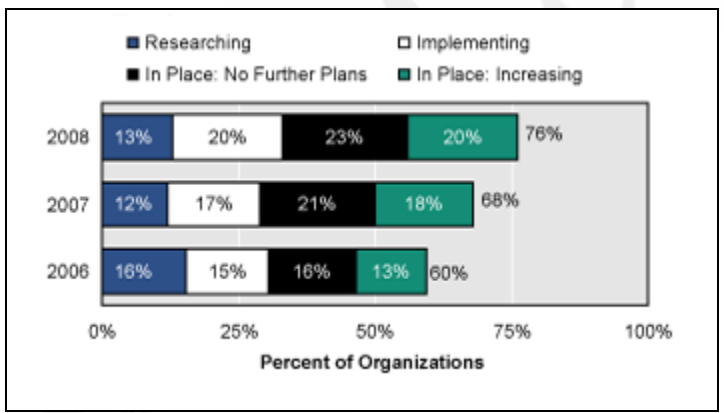
Figure 2. Data Center Consolidation Trends, 2006 to 2008

Percentages of Surveyed Organizations Citing Specific Actions