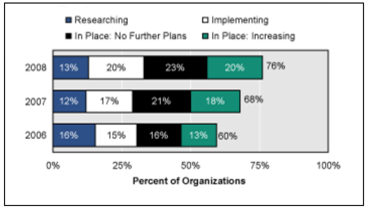
Figure 2. Data Center Consolidation Trends, 2006 to 2008 Percentages of Surveyed Organizations Citing Specific Actions