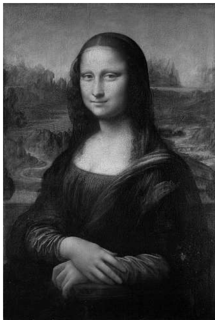
Leonardo da Vinci's Mona Lisa