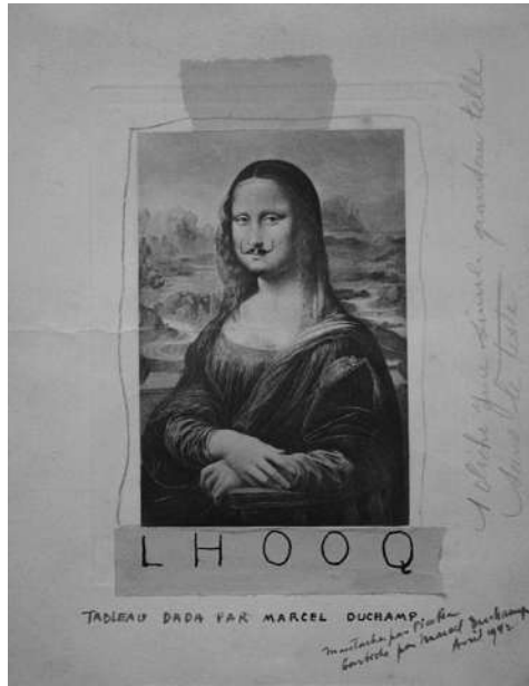
Marcel Duchamp's L.H.O.O.Q. or La Joconde

Of course, if a reproduction of an artwork does include original elements, then copyright can protect those elements. As the Second Circuit observed in Bell v. Catalda , creating a mezzotint reproduction of a public domain work requires the addition of elements not present in the original work, and copyright can protect those elements, because they are original to the mezzotint copy. 52 The Mona Lisa is in the public domain, so copyright can't protect a photographic reproduction. But if you paint a copy of the Mona Lisa , copyright can protect the differences between the original and your copy. And if you draw a moustache on the Mona Lisa , copyright can protect it as well.