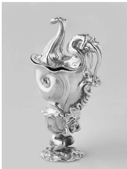
Adam Van Vianen, Memorial Guild Cup (1614) 7

Museum of Art provides open access to its collection using the Creative Commons CC0 public domain tool. 5 The Rijksmuseum also provides open access to its collection using the CC0 tool but encourages attribution to the author of the artwork and a credit to the museum. 6