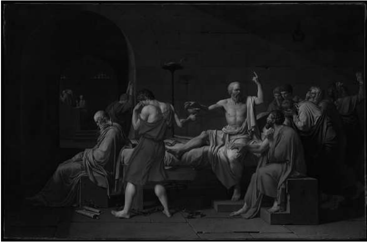
Jacques-Louis David, The Death of Socrates (1787) 8

But many museums have more restrictive policies. For example, the British Museum has adopted a “Creative Commons Attribution-NonCommercial-ShareAlike 4.0 International (CC BY-NC-SA 4.0) licence” and only requires researchers to pay licensing fees for commercial uses of images of artworks in its collection. 9 However, it has adopted a very broad definition of commercial. Specifically, the British Museum considers a publication “commercial” unless it is available to the public for free. 10 For better or worse, most art history scholarship is published in academic journals and books that are sold. According to the British Museum, those are commercial publications, so the authors have to pay a licensing fee, even though the circulation of the academic journals and books is usually quite limited. Other museums flatly