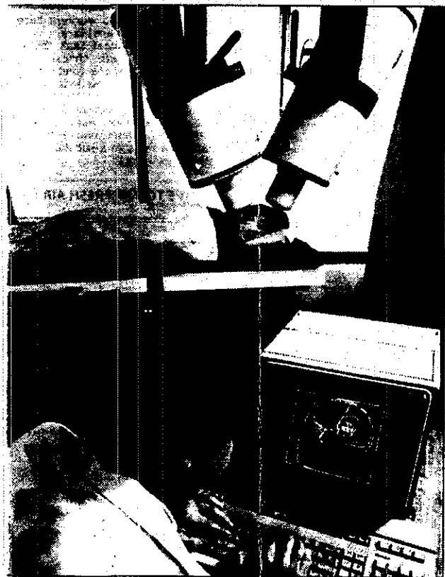
A neuromagnetometer monitors a patient's brain activity. The device, built by Biomagnetic Technologies, uses superconducting materials.