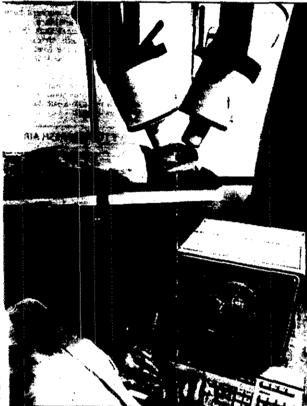
Neuromagnetometer monitors a patient's brain activity. The device, built by Biomagnetic Technologies, uses superconducting materials.