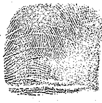
3. RIGHT MIDDLE