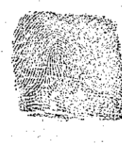
5. RIGHT LITTLE