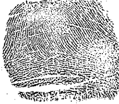
1. RIGHT THUMB