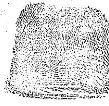
8. LEFT MIDDLE