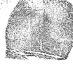
6. LEFT THUMB