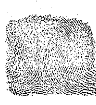
4. RIGHT RING