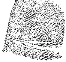
7. LEFT INDEX