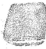
10. LEFT LITTLE