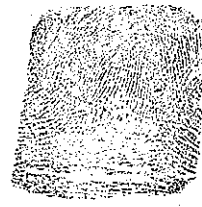
9. LEFT RING