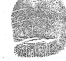
2. RIGHT INDEX