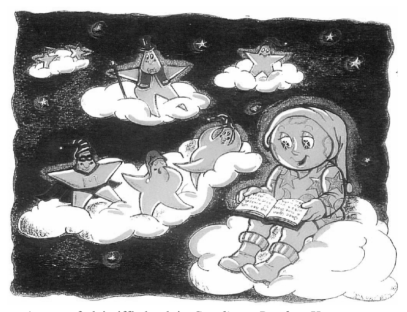
A page of plaintiff's book in Cavalier v. Random House.

TUSHNET MACROED.DOC 2/22/2008 8:47:50 AM