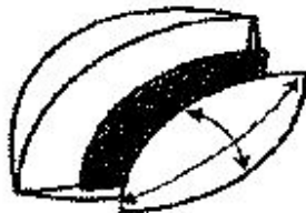
Depiction of a Toric shape

Perhaps the easiest way to understand the difference between a spherical optical zone and a toric optical zone has been suggested by the parties in their submissions to the court. As explained by both parties, a spherical optical zone takes a shape similar to the edge of a basketball: it is equally round throughout the zone. A toric optical zone, however, generally takes a shape more like the edge of a football: the curve is longer along one meridian, (usually the horizontal meridian) and shorter along a perpendicular meridian. Toric and spherical shapes are depicted in the illustration below, which appears in Plaintiff Bausch & Lomb's Opening Brief on Claim Construction, at page 5.